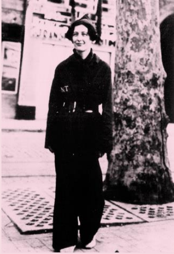
Simone Weil in Barcelona as miliciana for the CNT